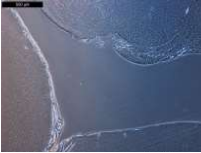
Control: Nestin-Cre rat