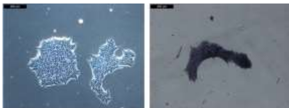
Figure 1b. Alkaline Phosphatase (AP) staining. ASC-9209 iPSCs stain positive for Alkaline Phosphatase: a typical unstained colony (a) was used to gauge the extent of the AP staining (b). Both images were taken at 5x magnification.